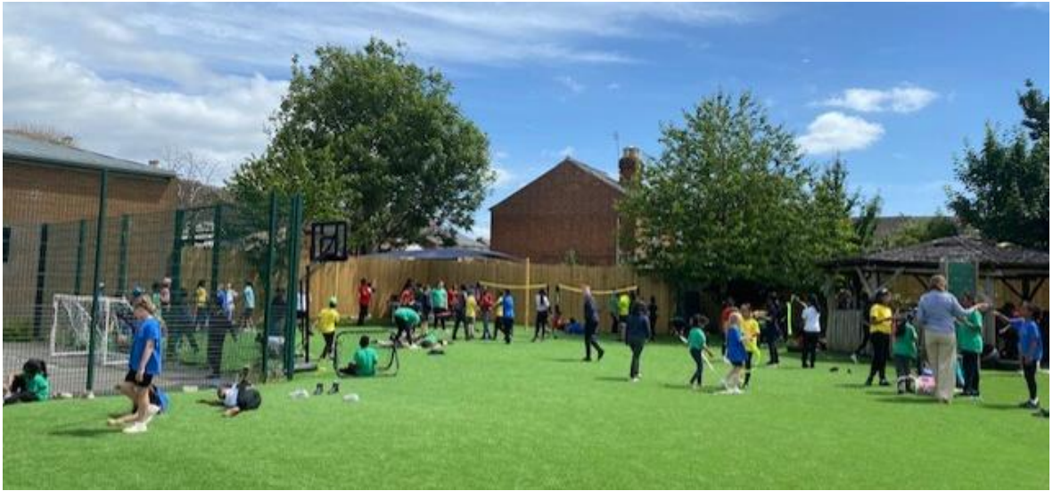
Here are some photos of the children enjoying the new play area and equipment at lunchtime