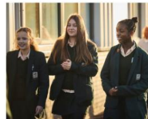
Proud to be Ribston

Our students are inspired to perform to the best of their ability, challenge themselves and go beyond expectations.