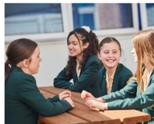
Confident and creative thinkers